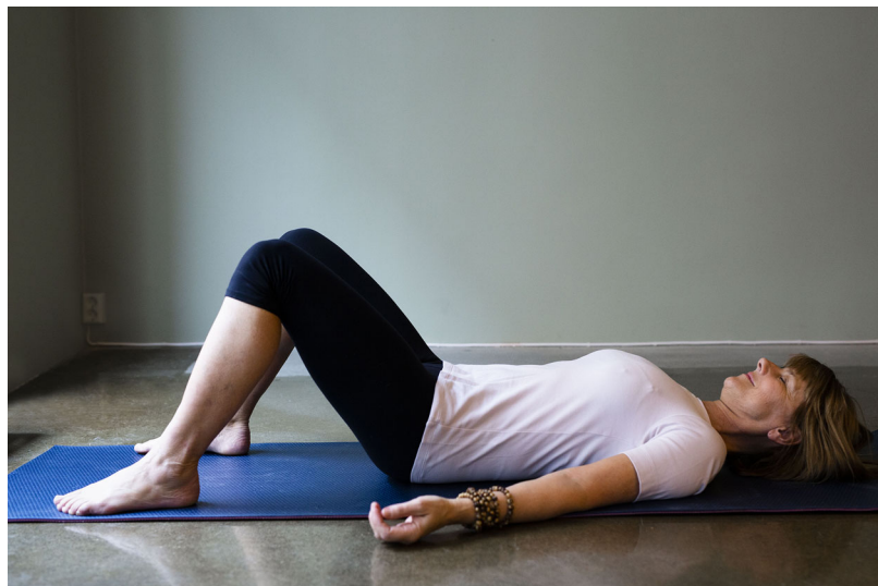
Figure 4. Letting the body surrender control allowing the body to shake.

The students' access to tremors often increases after they have become used to and familiar with the basic TRE exercises. Shaking can last for 10–30 minutes.