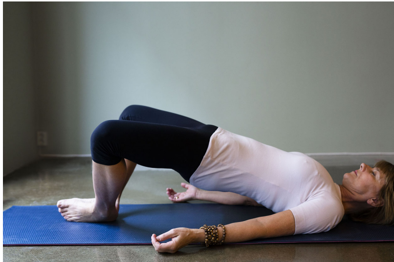
Figure 3. Exercise designed to fatigue the pelvic psoas muscles.