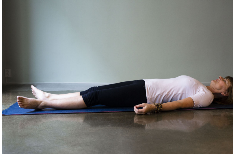
Figure 5. Open attention noticing changes and body sensations.

observing and supporting the students both physically through different types of touch and by creating a safe environment using the voice.