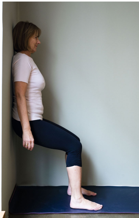
Figure 2. Exercise designed to fatigue the major muscle groups of the legs and pelvis.

Letting the body surrender control allowing the body to shake is the main part of TRE work and is happening during these sequences, especially when the pelvis is resting on the floor. The shaking then is the body's innate response to lower the tension level built up during the exercises (Figure 4).